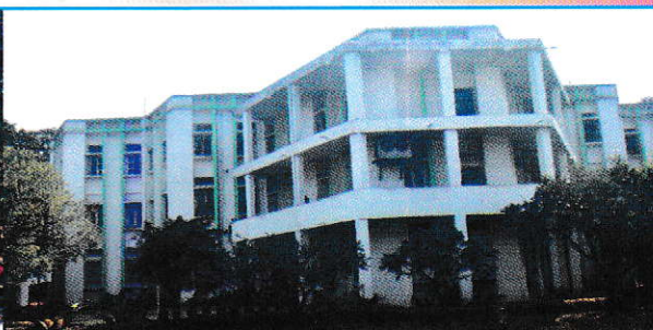
KMIPS,ROURKELA (BACK SIDE OF BUILDING)