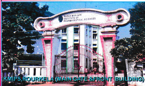
KMIPS,ROURKELA (MAIN GATE &FRONT BUILDING)

Spread over an area of around 3 acres of beautiful campus. KMIPS is located at Chhend, Rourkela in a lush green environment 1 km away of BPUT and around 7 km away from Railway Station, Rourkela and around 3 kms from AirPort.